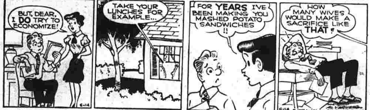
BONNIE BY JOE CARROLL