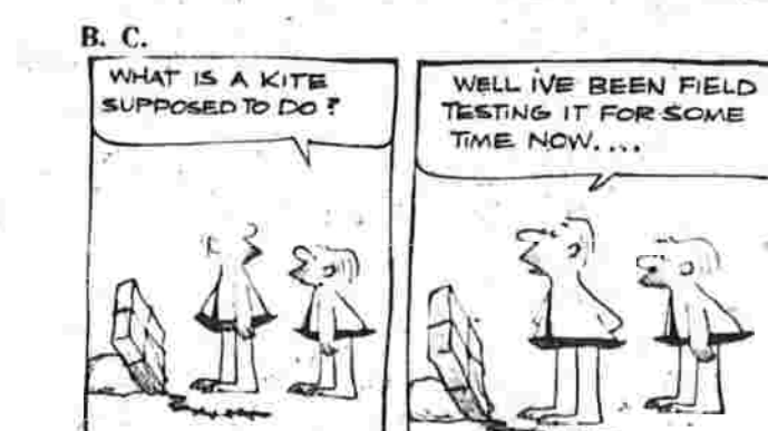
R. C. BY JOHNNY HART