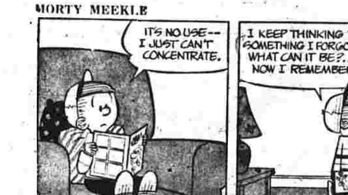
MORTY MECKLE BY DICK CAVALLI