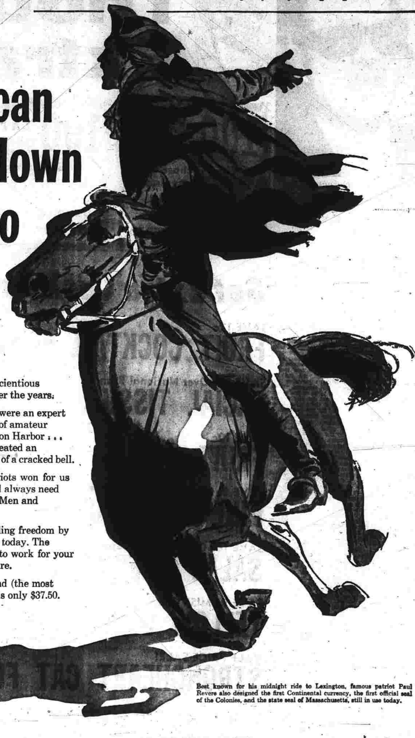
Best known for his midnight ride to Lexington, famous patriot Paul Revere also designed the first Continental currency, the first official seal of the Colonies, and the state seal of Massachusetts, still in use today.