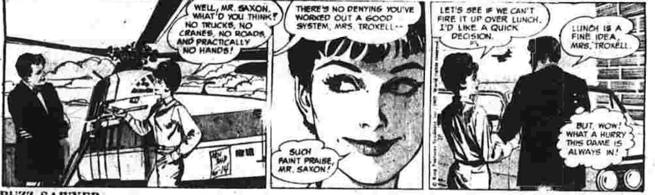
BUZZ SAWYER BY ROY CRANE