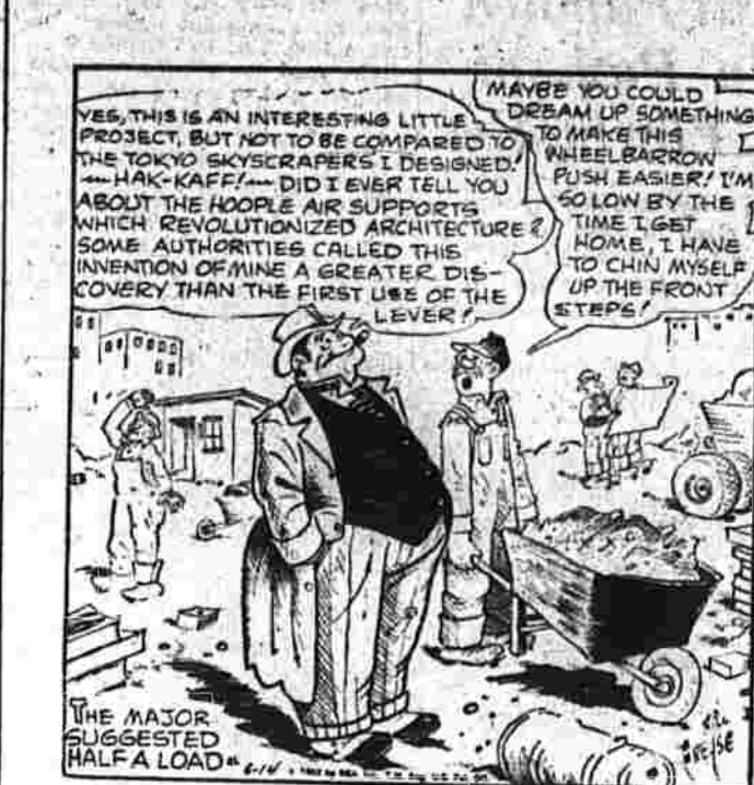
OUR BOARDING HOUSE with MAJOR HOPPLE