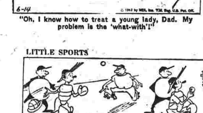
LITTLE SPORTS BY ROUSON